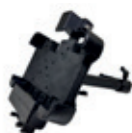
E10B Vehicle dock with key lock, Ethernet, DC jack, 2 USB, RS232 DB9, kit fixation AT-CAE1011B AT-CAE1011B1