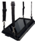
Harness carrying case AT-CAE8010