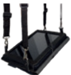
Harness carrying case AT-CAE702