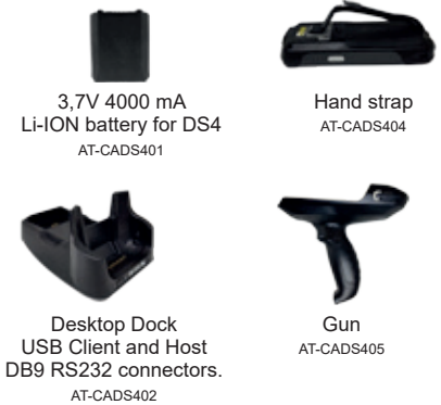
3,7V 4000 mA Li-ION battery for DS4 AT-CADS401

Shipped with : 4000 mA 3,7V battery pack, hand strap, cradle, screen protection, USB cable, power supply.