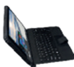
Removable QWERTY keyboard AT-CAE1210