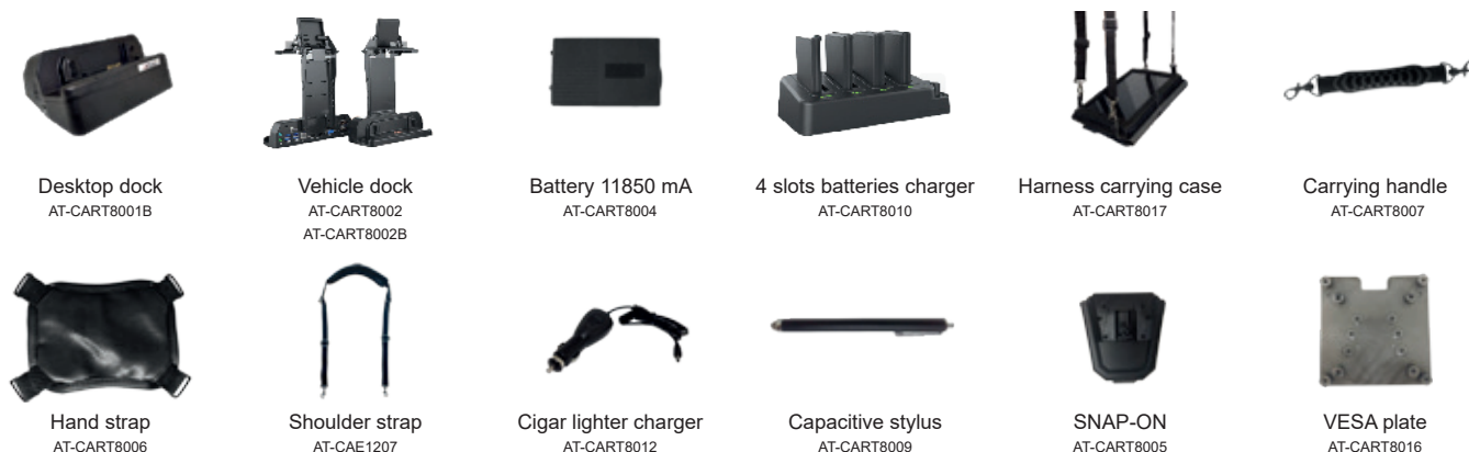
Desktop dock AT-CART8001B

Android or Windows platform, hot-swappable battery, industrial accessories, extended connectivity, very rugged.