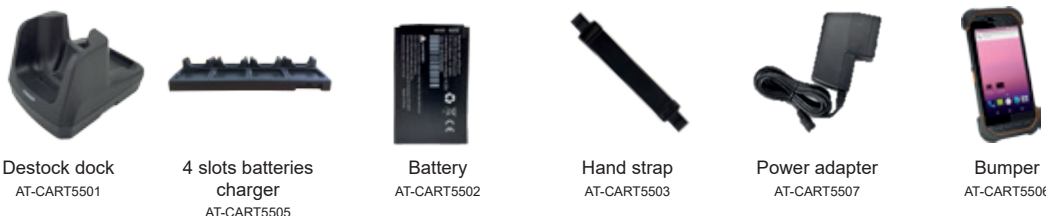
Desktop dock AT-CART5501

Removable battery, very rugged, integrated hand strap, Full HD display, USB Type-C.