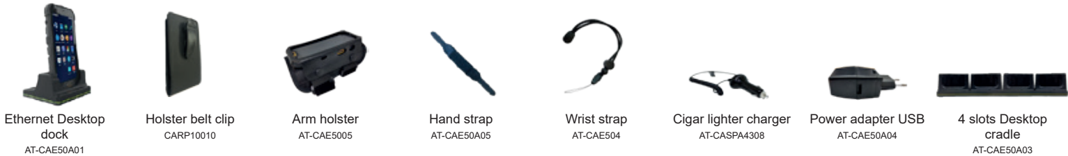
Ethernet Desktop dock AT-CAE50A01

Classic smartphone design but very rugged, Qualcomm processor, USB C.