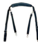
Harness strap AT-CAE1207B