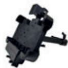
Vehicle Dock AT-CAE8011B