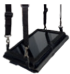
Harness carrying case AT-CAE10L01