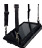
Harness carrying case AT-CAE1013