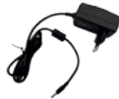
Power adapter AT-CAE805