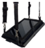
Harness carrying case AT-CAE8L05