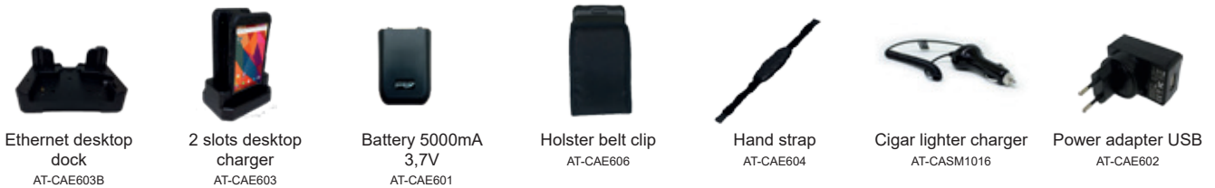
Ethernet desktop dock AT-CAE603B

Widescreen display, removable battery, very rugged, communication base.