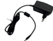
Power adapter 5V AT-CAE805